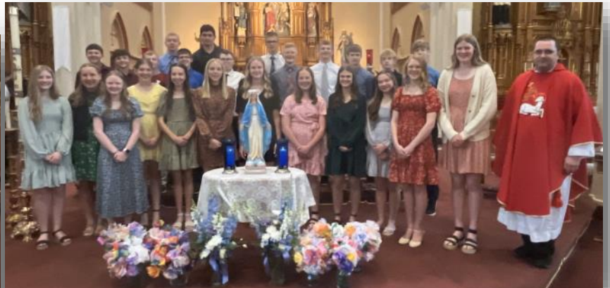
Throughout history, Catholics have long honored the Blessed Virgin Mary during the month of May. To symbolize her significance in the Church and in our lives, the "May Crowning" is set up to display her queenship as the mother of Jesus.